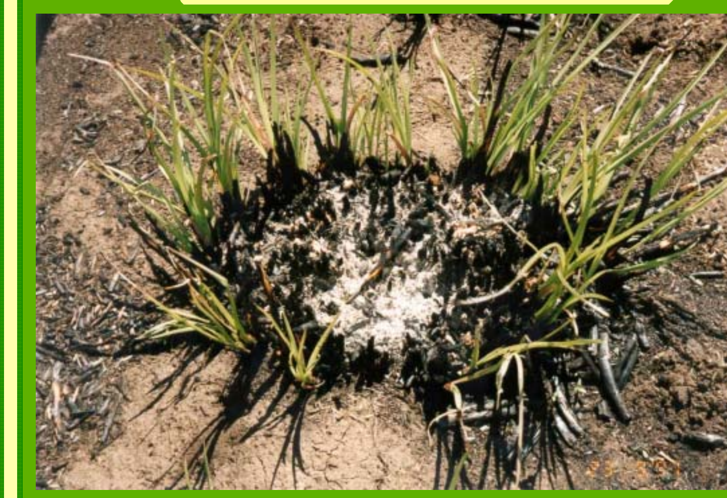
Badly burnt by a very hot fire