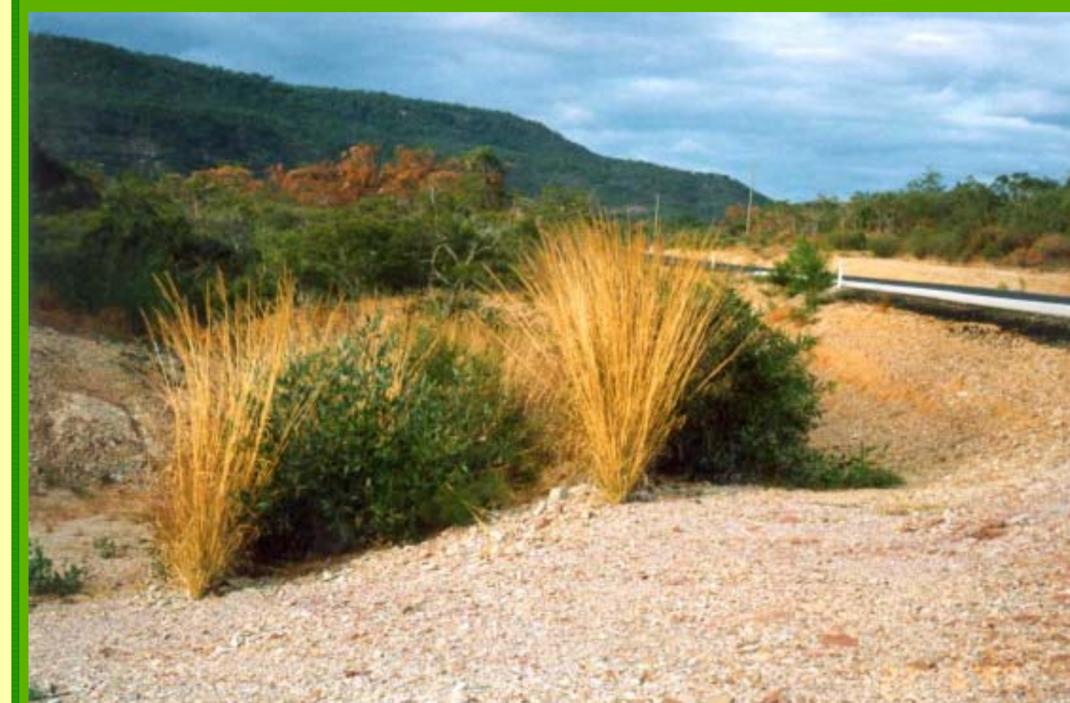
Providing favourable conditions for voluntary return of native plants