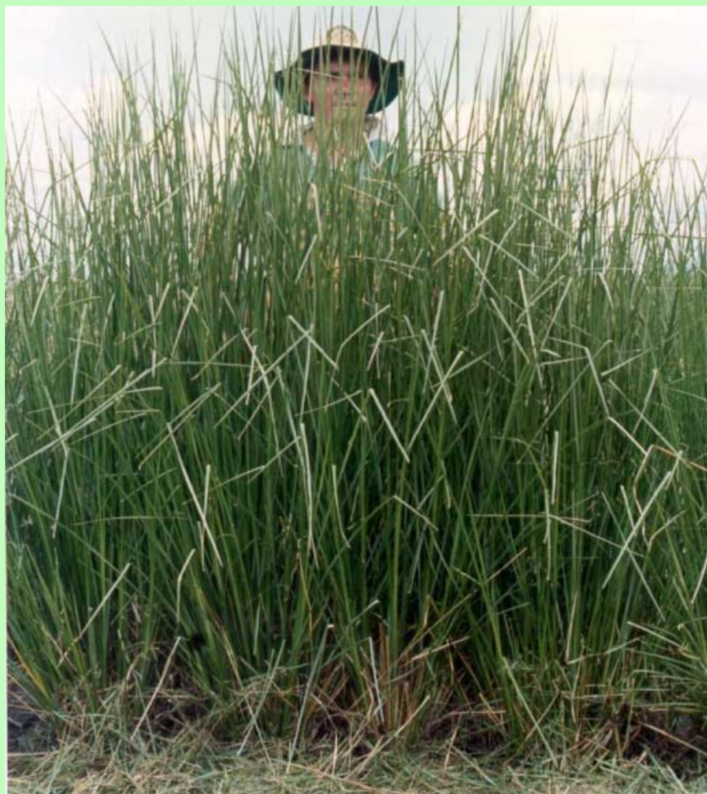
Tall, erect and stiff stems