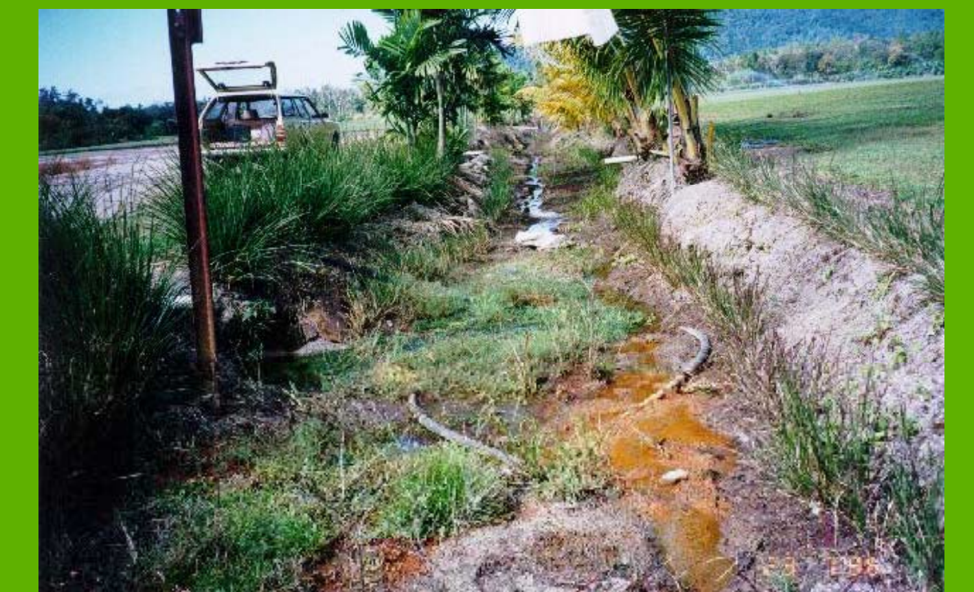
Highly tolerant to Acid Sulfate Soils with pH as low as 3.0 and toxic levels of Al and Mn