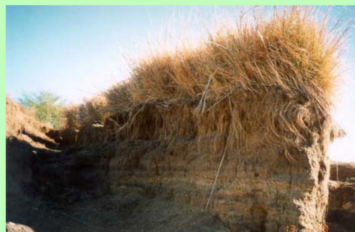
Root penetration equivalent to 1/6 mild steel reinforcement