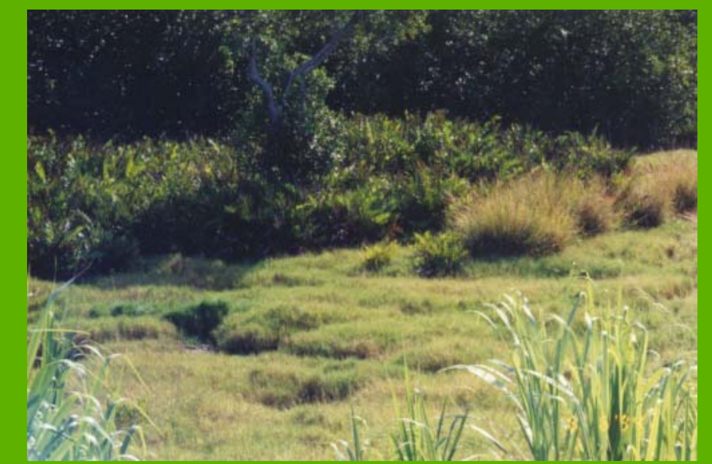
Highly tolerant to saline conditions . Growing next to mangrove on tidal flat