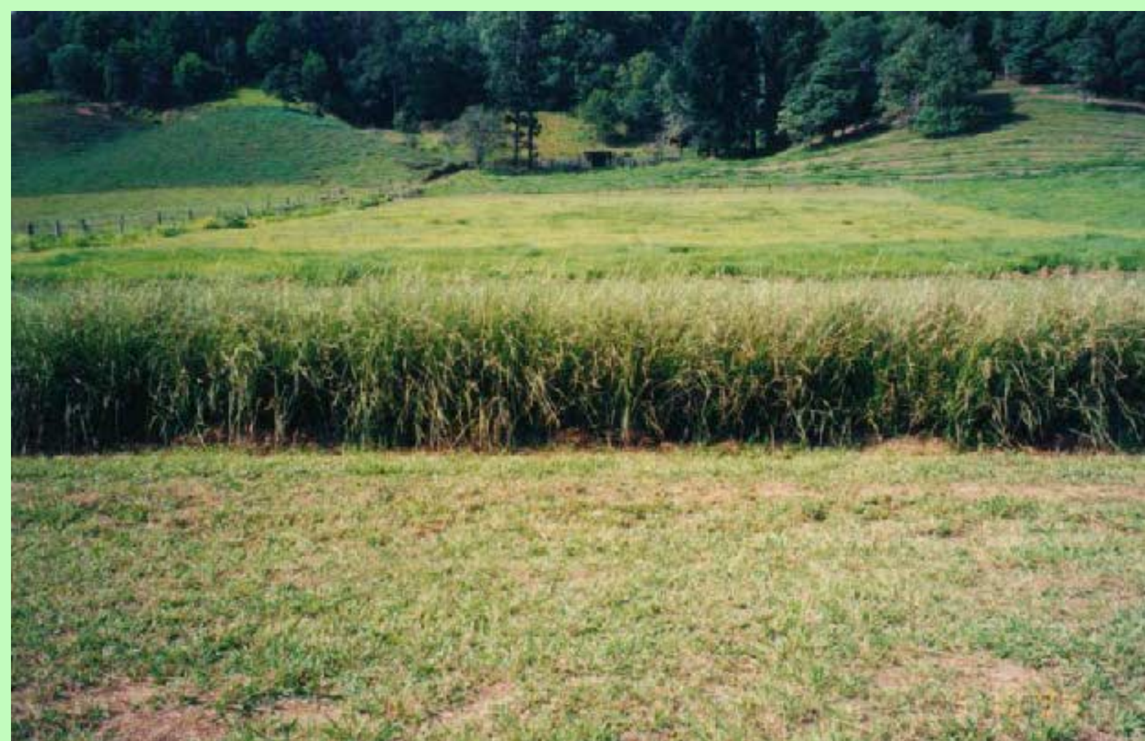
Forming thick hedge when planted close together