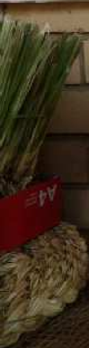
Figure 1 - The woven basket (left) and the woven basket (right) are made of natural fibers.