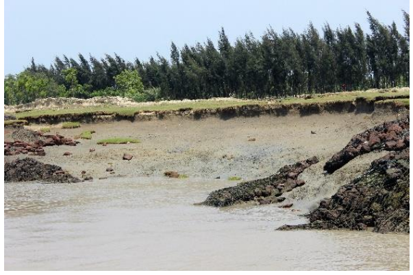
Protection dike on GHORAMARA Island