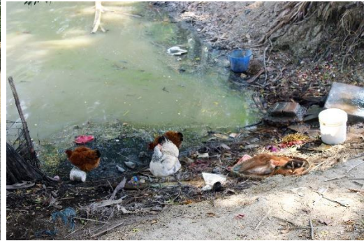
Village Community toilet front and back, discharge effluent to village pond