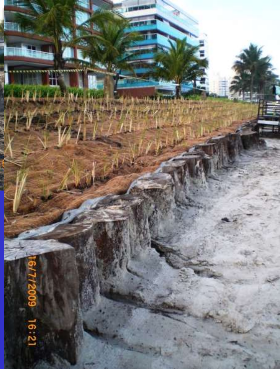
Wooden palisade in high risk area, before and after biodegradable jutemesh installation.