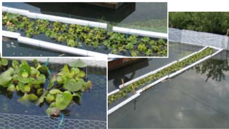
The basket-line build up in Az.1 and plants of water jacinth after 1 week of system set up (8 June 2006).