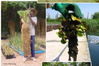
The plants used: vetiver (left) and water jacinth (right).