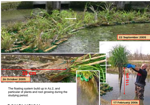
The floating system build up in Az.2, and particular of plants and root growing during the studying period.