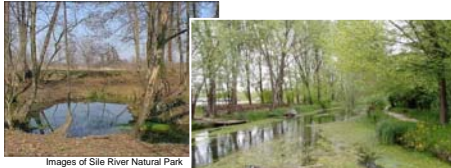
Images of Sile River Natural Park

The results are very encouraging considering the continuous effluent flow, at least 100 l s -1 , the partial time functioning in Az.1, and the delay start up in Az.2.