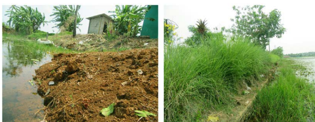
Bund erosion in study area