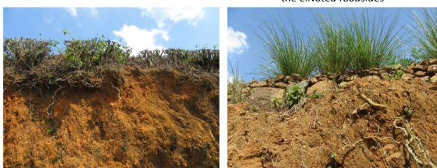
Land slip problem in tea estates