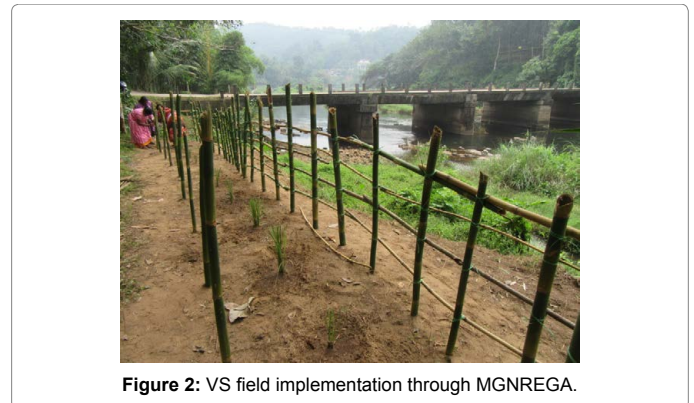
Figure 2: VS field implementation through MGNREGA.

Present disaster risk management activities in India, primarily focus on the structural aspects of disaster management and ecosystem based interventions have been lacking [6,21]. The vetiver grass focused on the current study has excellent Eco-DRR efficiencies. Successful application of the VS can reduce or even eliminate many types of natural hazards such as landslides, mud slides, road bund instability, and erosion [22-24]. The application of vetiver grass along muddy roadside (case study I) and in the tea plantation (case study II) are found