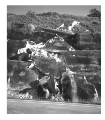
Fig. 2 Hard surface breaks up too!

An alternative solution, as mentioned in the Introduction, is to resort to vegetation, in this case vetiver, to help strengthen the surficial 1-1.5 m layer that is prone to slippage. How vetiver roots help in the strengthening the outer zone is explained diagrammatically below (Fig. 3):