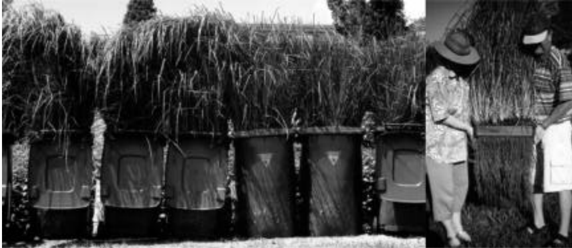
Photo 4 Trial 2, hydroponic Vetiver treatment of effluent

In the third trial, a flow-through system (Photo 5) was used and it was conducted from February to May 2003. The aim was to find out if flow improved the treatment, and if so, what flow rate was the best. Effluent was pumped through a series of large bins that contained ~ 600 L of effluent and a trial prototype bin that contained 330 L of effluent. Separate trials were conducted using different flow conditions, over an eight-day period: no flow, and flow rates of 4 L/min, 10 L/min and 20 L/min.