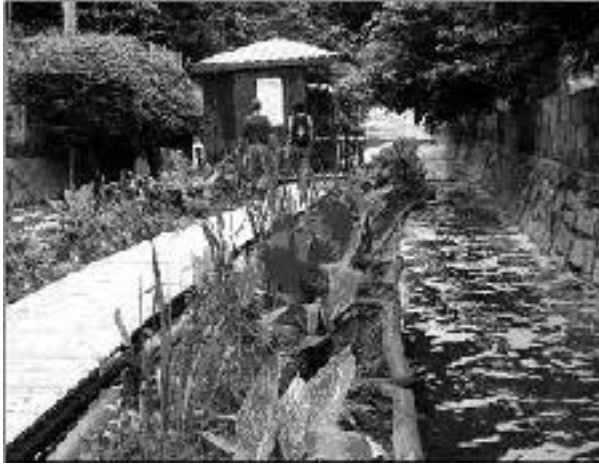
Photo 1 Hydroponic treatment of sewage with other plants