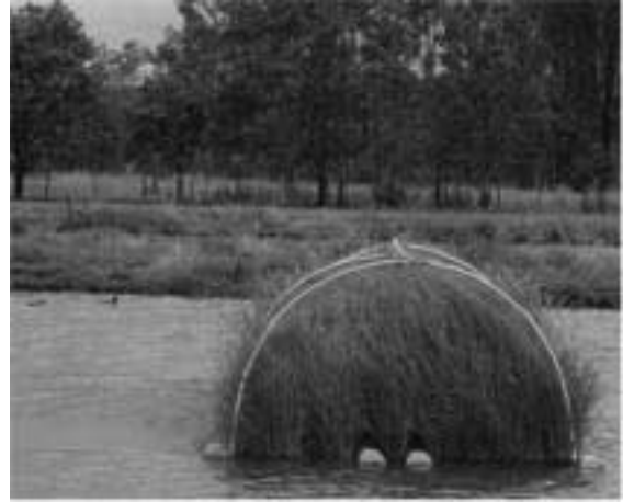
Photo 2 Hydroponic treatment of sewage with Vetiver