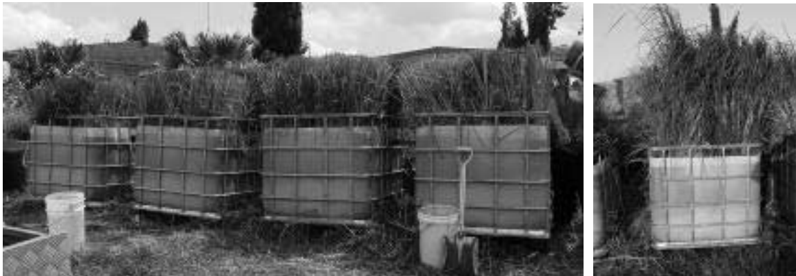
Photo 5 Trial 3, hydroponic Vetiver treatment of effluent, left, cut back at the start of the trial and right, vetiver growth after trial period

Sampling for water quality analyses was conducted at the start of the trial, on some occasions during the trial, and at the end of the trial. Water quality analyses were conducted according to the needs of the analytical test: close to the bins at the time of sampling, in the motel room soon after sampling, on defrosted frozen samples requiring laboratory testing by the senior author using Hach reagents and colorimeter, or by a registered laboratory.