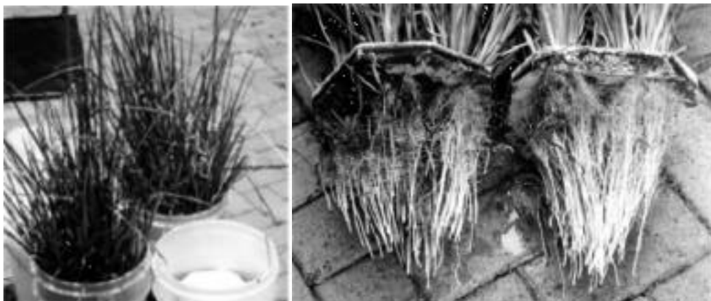
Photo 3_Trial 1, hydroponic Vetiver treatment of effluent

The second trial was conducted to find the best growing medium for vetiver, how long it took Vetiver to treat effluent in colder conditions, and to note any other management problems. Media used ranged from still hydroponic with no supporting medium, recirculated hydroponic with no supporting