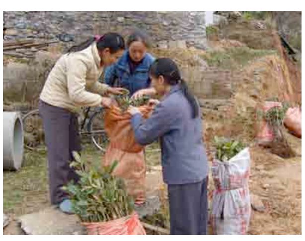
Women are checking seedling quality and quantity