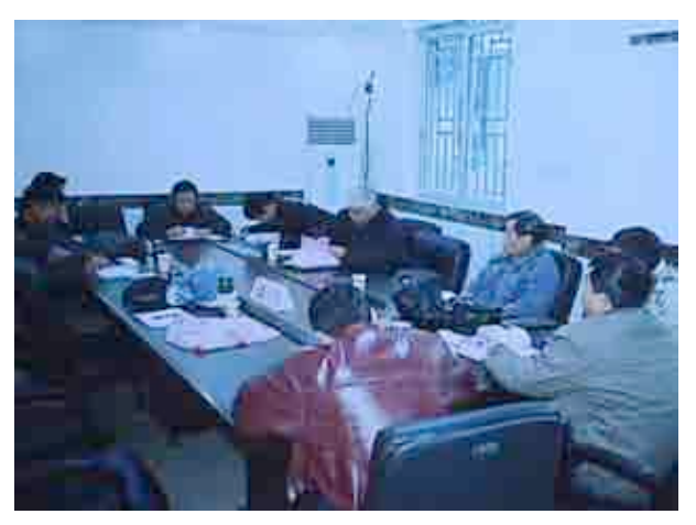
Meeting at the County Agri. Bureau