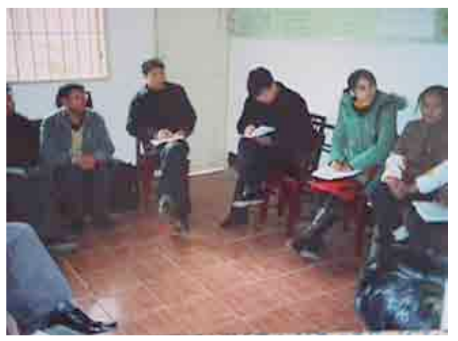
Discussion with Village Group