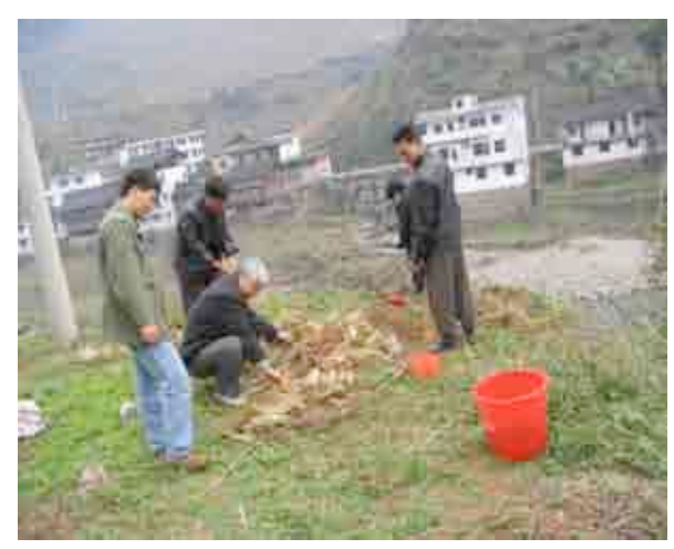
Demonstration how to plant vetiver to village leaders