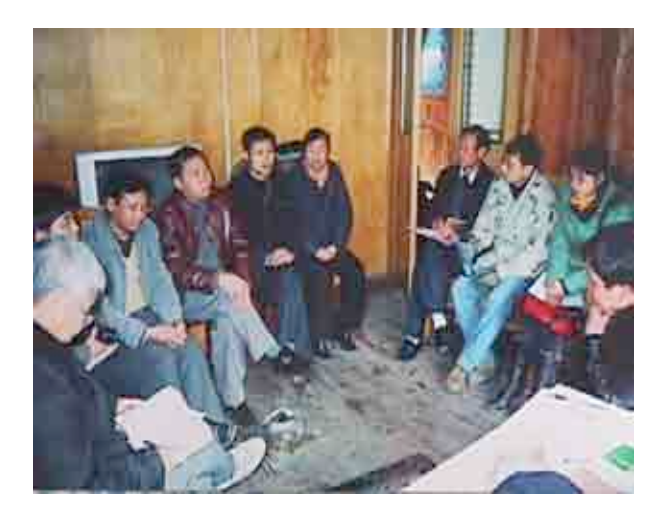
Talking to farmers