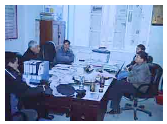
Group discussion at Environmental Station