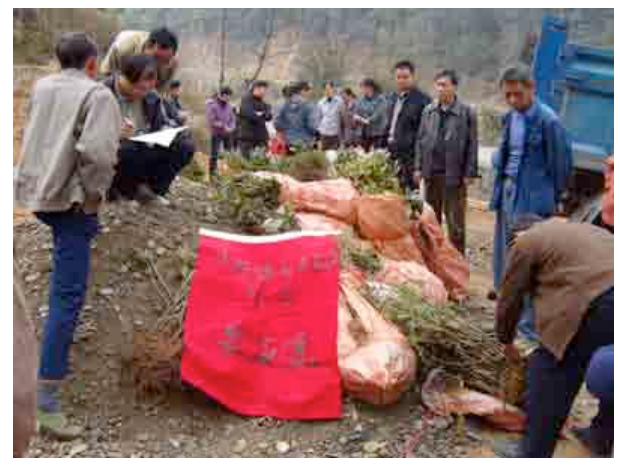
Tree seedling distribution in the village group