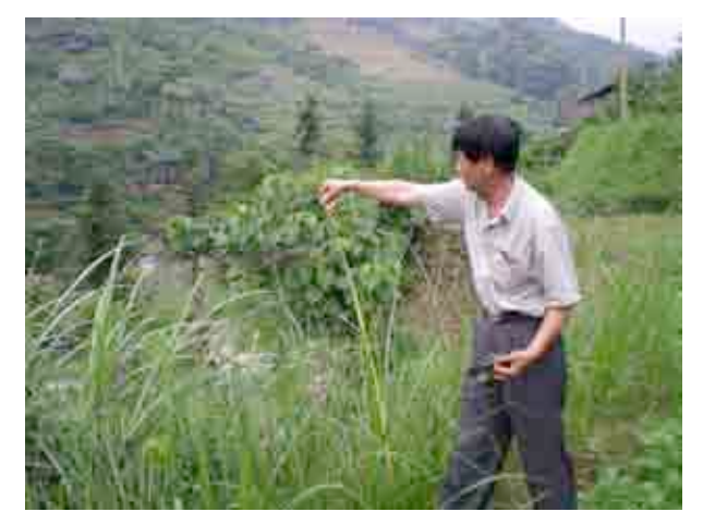
Observe vetiver growth