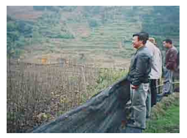
Investigate pear seedlings