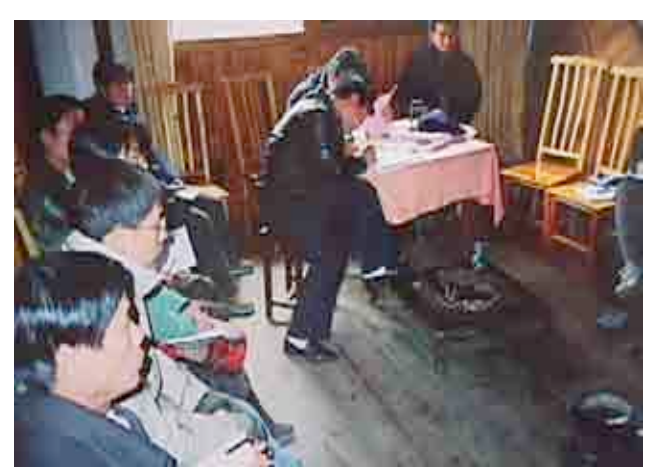
Discussion in the Zhoujia village