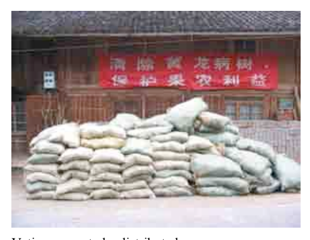
Vetiver grass to be distributed