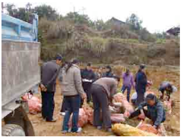
Allocation of tree seedlings in the village