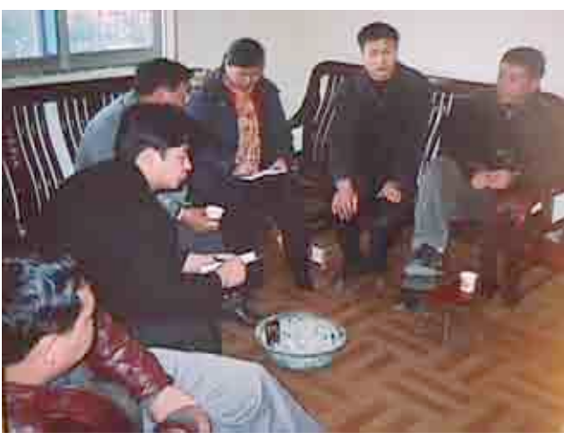
Discussion with farmers