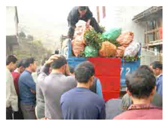
Tree seedlings shipped to the township