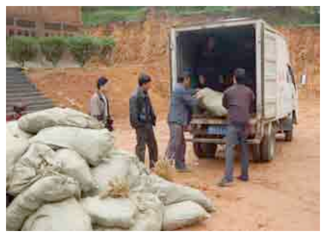
Vetiver sent to village group