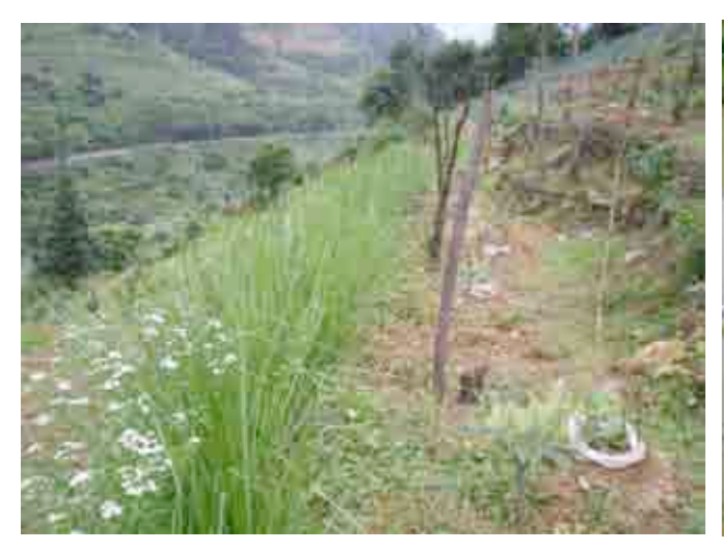
Vetiver protected fruit trees in just two months