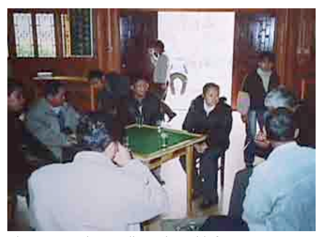
The woman Director discussing with farmers