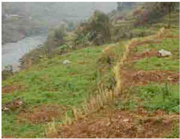
Newly planted vetiver at the edge of the terrace