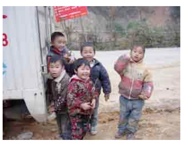
Children welcome the project team