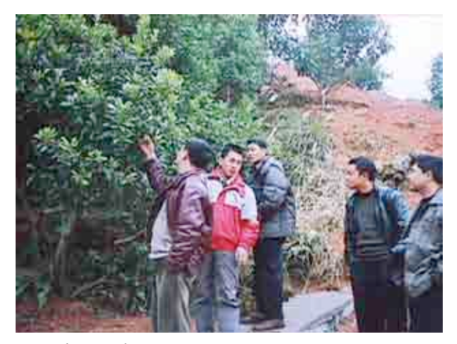
Investigate arbutus tree