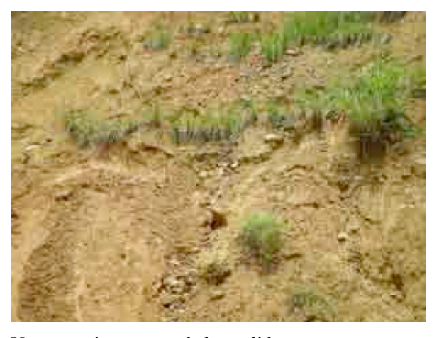
Young vetiver stopped slope slides (soil below the vetiver hedge was slide)