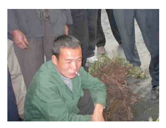
Man also very happy