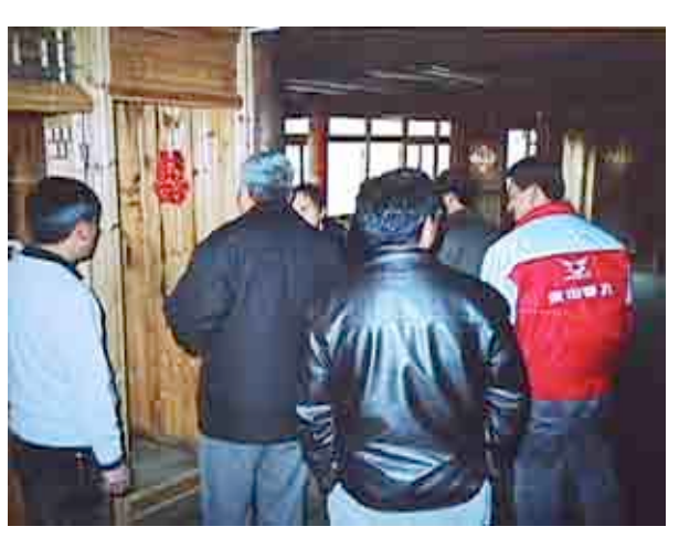
Visiting farmers family