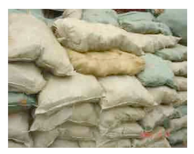
Vetiver seedling shipped to the township