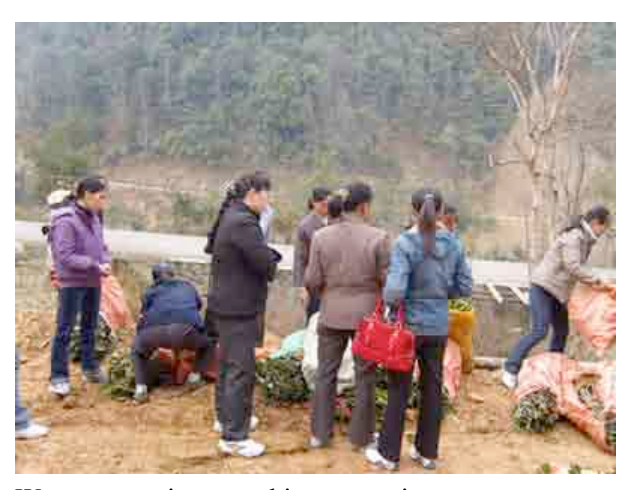
Women very interested in economic trees