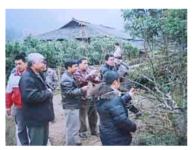
Observe pear tree at Batai Village