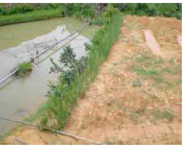
Using vetiver to protect fish pond