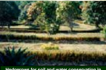
Hedgerows for soil and water conservation in orchard, Thailand