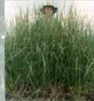
Erect, stiff stems and thick growth. The dense base is essential for reducing flow velocity and trapping sediment