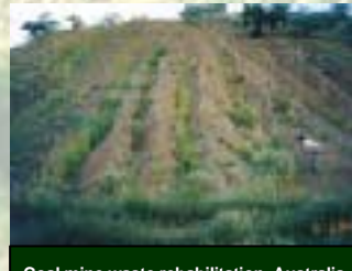
Coal mine waste rehabilitation, Australia