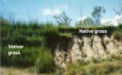
Road batter stabilisation trial, Australia