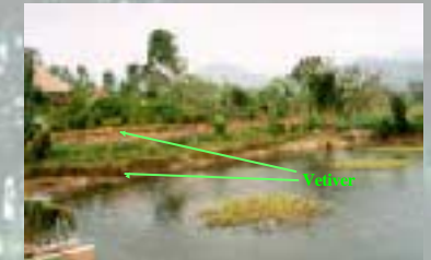
Queen Mother garden, Thailand