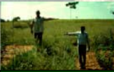
Sediment built up above the contour hedge after 5 years, India