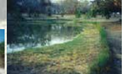
Trapping sediment and debris on a farm pond, Thailand