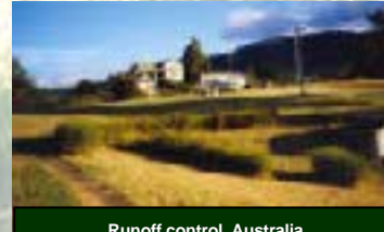
Runoff control, Australia