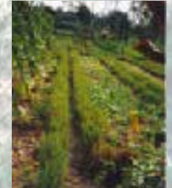
Borders of vegetable beds, Thailand