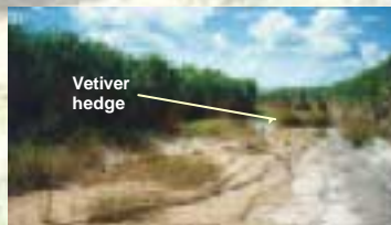
Living filter traps sediment in a waterway on a sugarcane farm, Australia