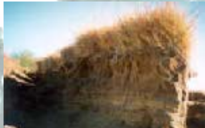
Deep and extensive vetiver roots, equivalent to 1/6 of mild steel reinforcement, provide necessary structural strength to prevent this earthen wall from collapsing