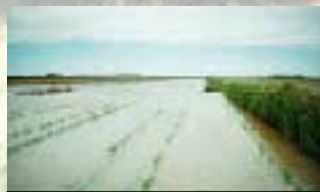
Flood erosion control on the floodplain, Australia