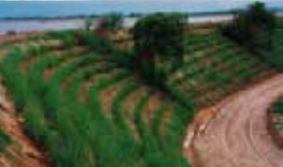
Stabilisation of mine tailings dam, Australia