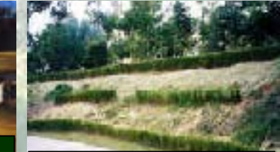
Erosion and sediment control, Australia