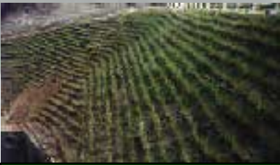
Stabilisation of highway batter, El Salvador