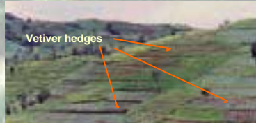
Soil and water conservation practice on sloping land, Thailand