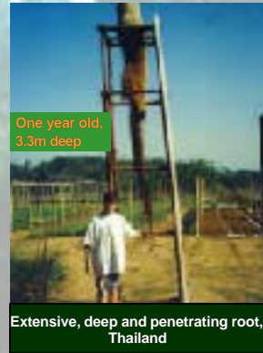
Extensive, deep and penetrating root, Thailand