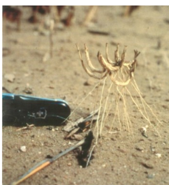
Figure 1. About 50 mm of soil blown from cropland in Kansas during the winter of 1995–1996 (E.L Skidmore, USDA, Manhattan, KS. photo spring of 1996).

Wind energy also has great power to dislodge surface soil particles and transport them long distances. A dramatic example of this was the wind erosion in Kansas during the winter of 1995–1996 when it was relatively dry and windy. At this time approximately 65 t/ha of soil was eroded from this valuable cropland (Figure 1). Wind energy is sufficiently strong to propel soil particles thousands of kilometers. This is illustrated in the photograph by NASA (Figure 2) which shows a cloud of sand being blown from Africa to South and North America.