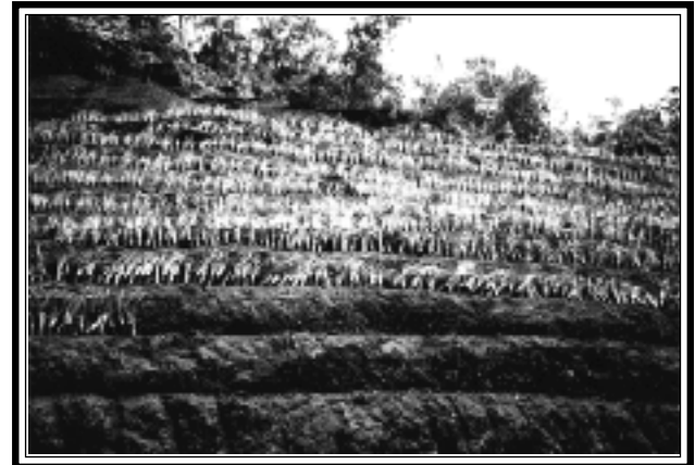
Philippines: Vetiver hedgerows under partial shade protecting a fruit orchard. Rainfall over 2000 mm annually.