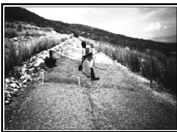
Haiti: Vetiver Grass Hedgerows planted to protect vegetable gardens on degraded lands.