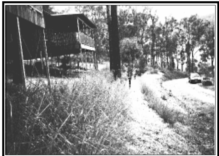
Below: Australia , Queensland: Vetiver Grass Hedgerows planted along housing area to stabilize the embankment and prevent pollution and trash "invading" the road.