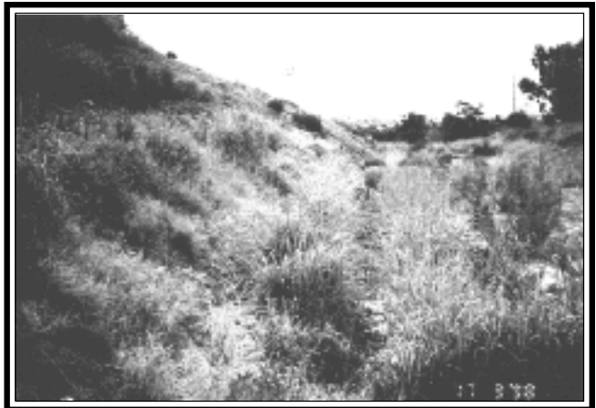
Spain, Lorca: These vetiver hedgerows were planted four years ago to protect a fill section of a highway. Note the control section in the center where major and deep rilling has occurred. Once the vetiver is properly established (right) natural vegetation colonizes the inter hedge areas. The climate here is Mediterranean with a rainfall of only 250 mm per year.