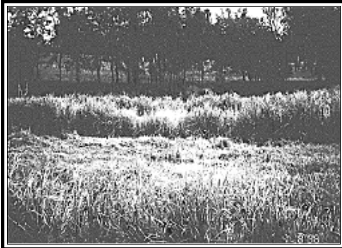
Australia, Queensland: A Severely eroded gully rehabilitated with vetiver grass hedgerows.