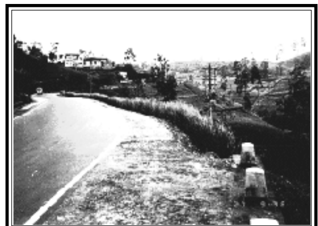
Sri Lanka: Vetiver hedgerows used to protect tea gardens and to reduce silt from filling the old silt tanks in the tea gardens.