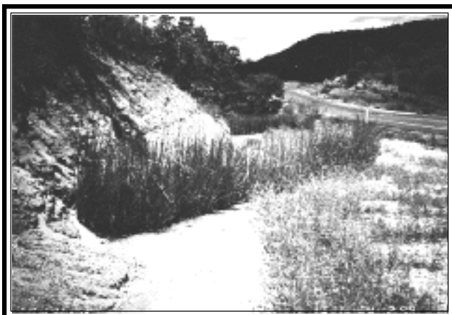
Australia, Queensland: Highway drain stabilized with vetiver grass hedgerow. Note the trapped silt behind the hedge.