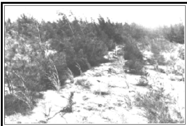
China, Guangdong Province: A coastal area subjected to highwinds. Here vetiver has been planted between casurina trees on sand dunes close to the sea to help reduce wind erosion. Photo at right is a close up of well grown vetiver on beach sand.