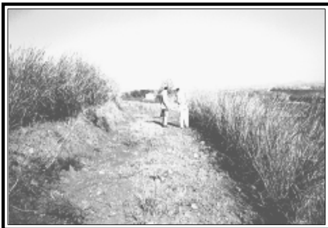
China, Hubei Province: Vetiver planted in 1998 as hedgerows to protect terraced land.