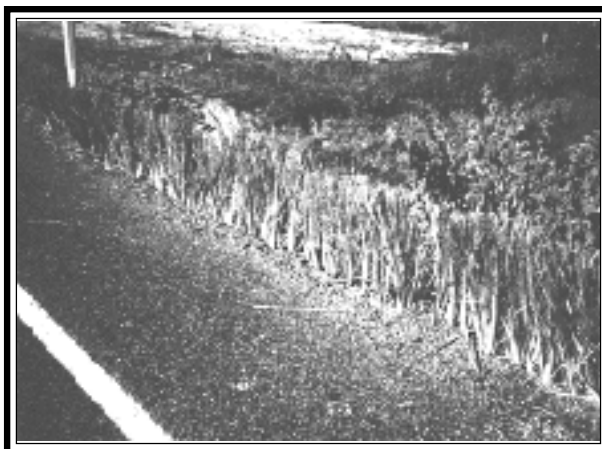
Australia: Queensland: The bitumen edge of a highway stabilized with vetiver grass hedgerow.