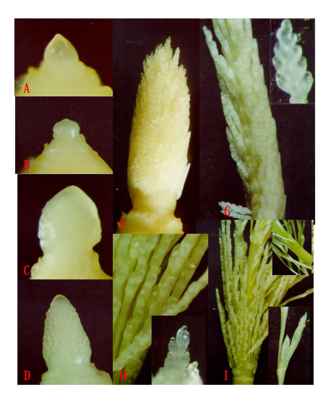
Fig. 1. Morphological changes in vetiver grass apical development: