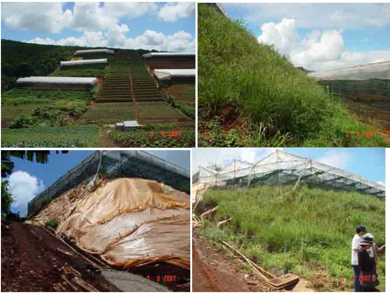
Stabilisation of fill slopes created for glasshouses and at the same time absorption of nutrients in runoff from flower beds