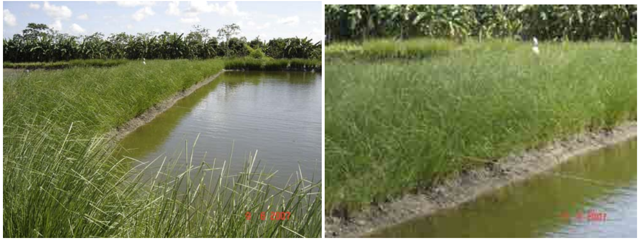
Batter stabilisation and treating high nutrient pond water at the same time