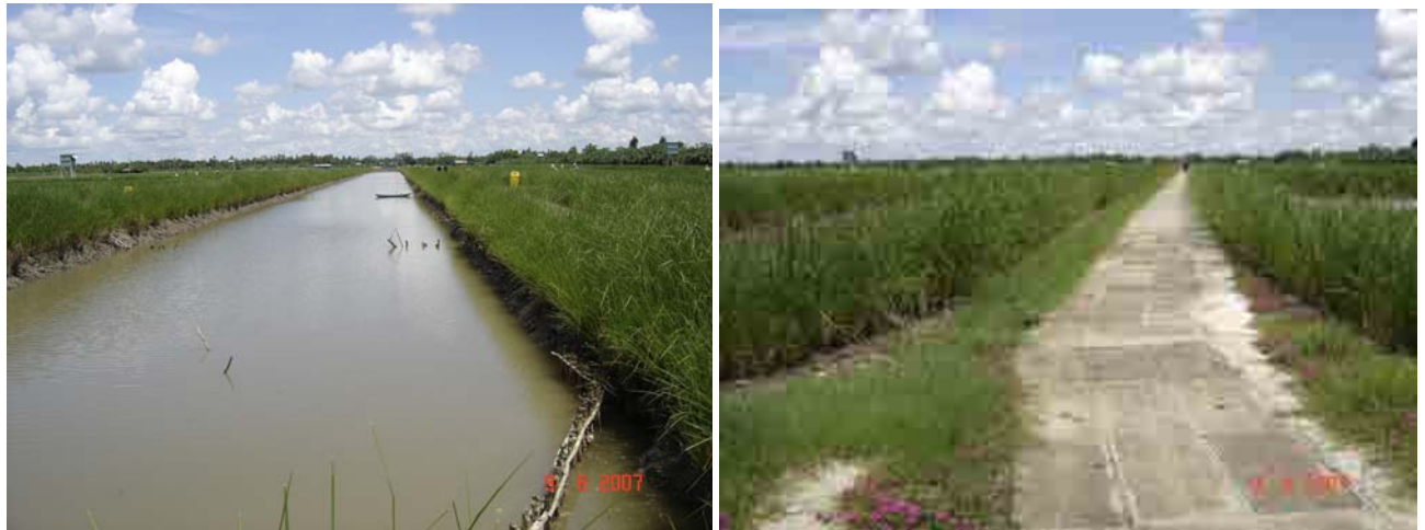
Water intake canal