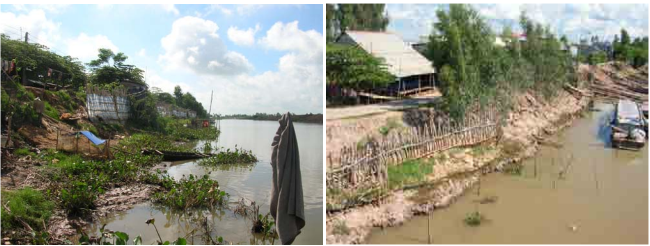
Badly eroded batter and current erosion control measures