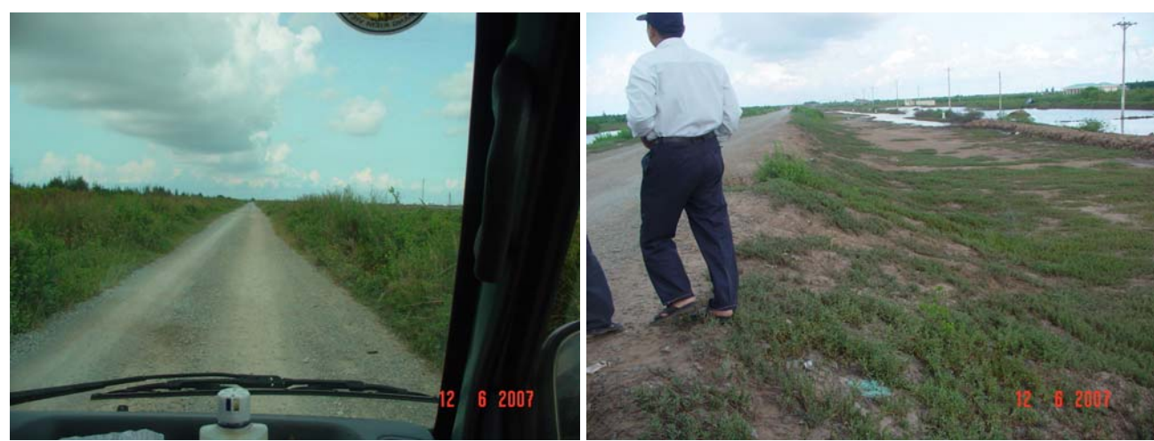
The two year old, 11km dike protected. with vetiver

It was so successful that they will plant vetiver on a new 33km dike near by on a reclaimed mangrove swamp. The local authority was very happy with the result, as mentioned that VS is much more effective than they first thought.