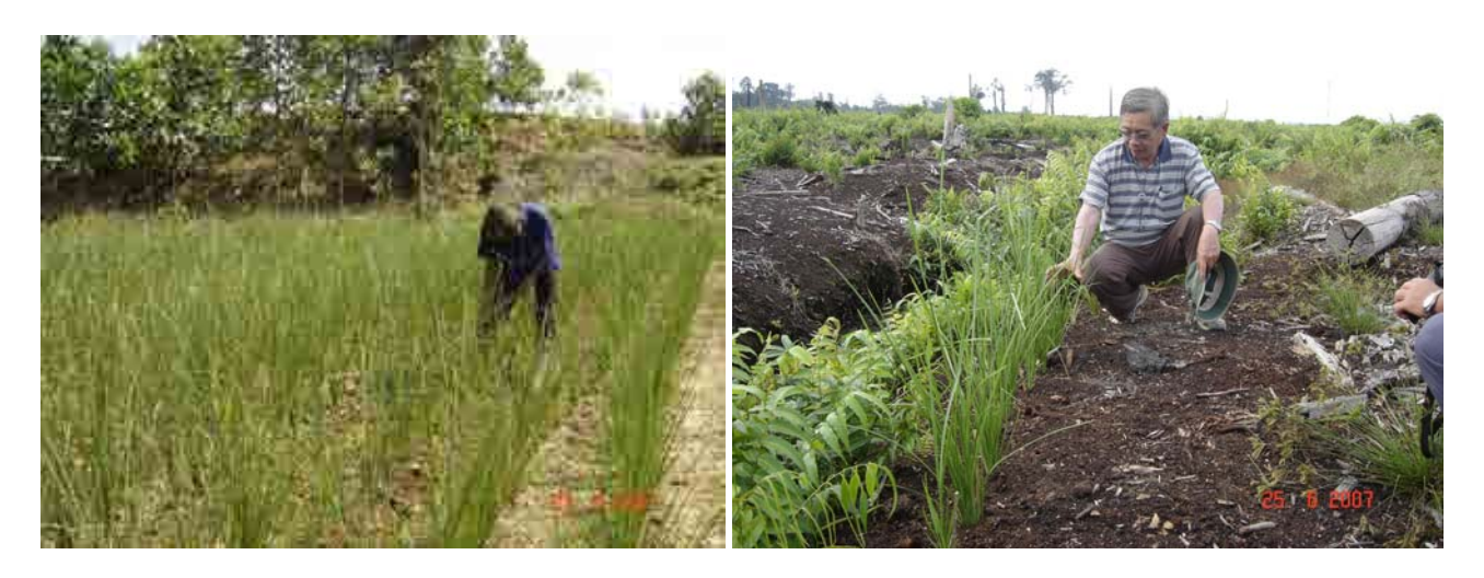
Left: Two month old Nursery