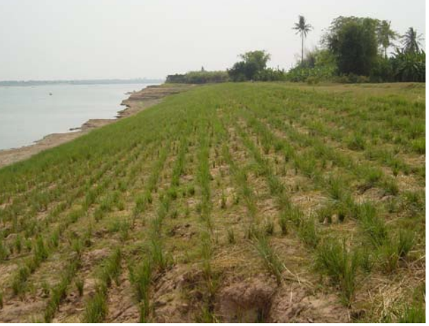
Planting following earth shaping