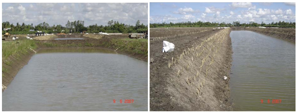
Planting in progress on new ponds