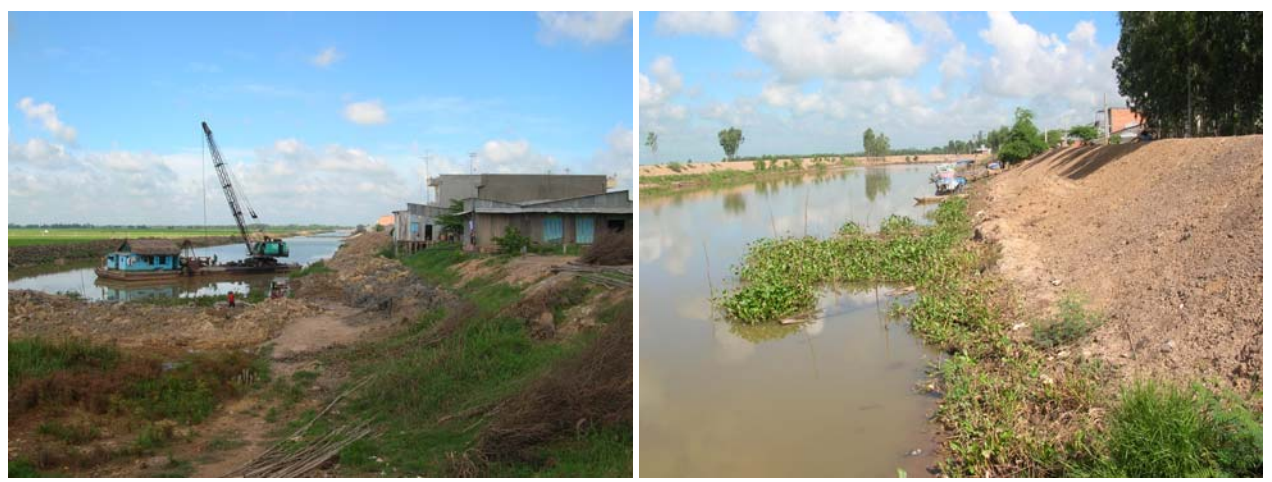
Reshaping batter and batter ready for vetiver planting