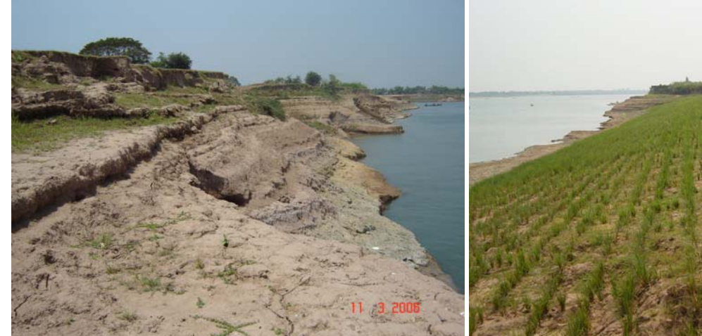
Badly eroded bank in March 2006

A 250m stretch on this property was planted with vetiver last year to test VS ability to control erosion under these extremely hostile conditions. This is a very important test for VS in riverbank stabilisation where the fertile but highly erodible alluvial soil of the bank is subjected to both wave and high velocity flow erosion, in addition to being submerged up to 6 six months under fairly muddy water. The planting is now ready to face this year flood season.