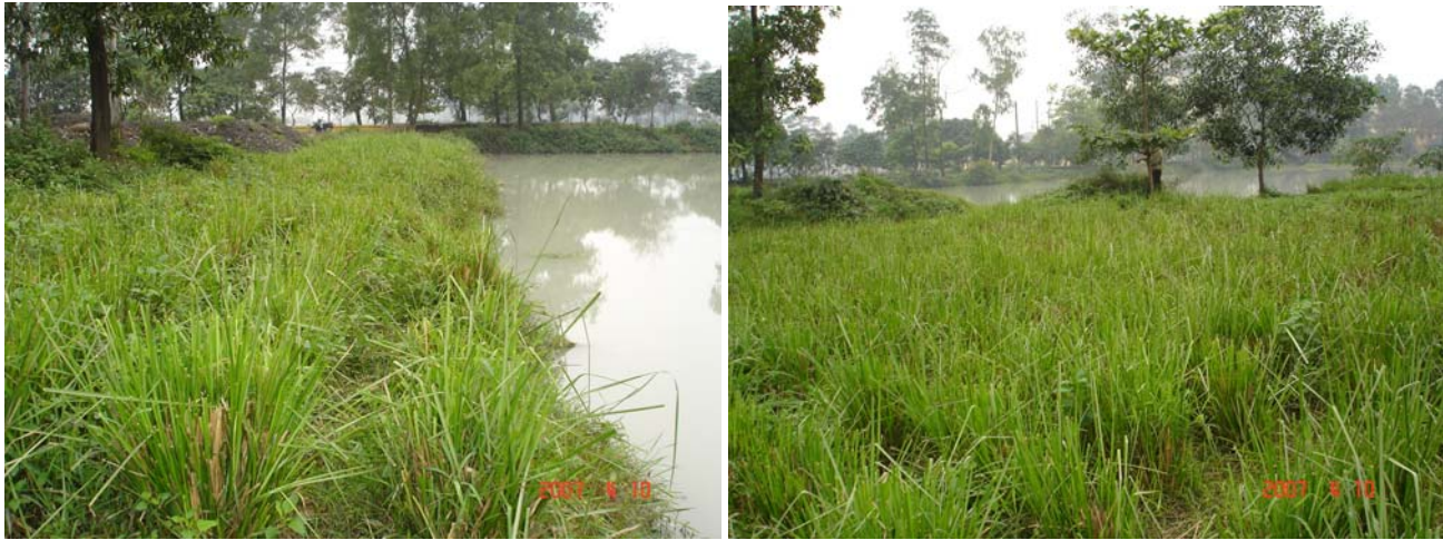
Vetiver is thriving on the bank of the retaining pond

Vetiver grew very well on these highly contaminated sites and due to the very impressive results, these factories are now in the process of expanding the planting area to increase the efficiency of the treatment.