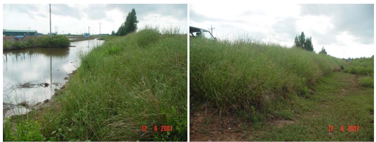
Inside batter facing prawn farms