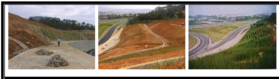
Figure 3. Vetiver system (VS) that being used on slopes, China (Grimshaw, 2006).