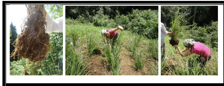
Figure 2. Esiroğlu Kirankaş location study area (594-610m), Trabzon, 2010.

In their studies, Sanguankao et al. (2003), Sanguankao et al. (2006), Xia and Shu (2003), found that Vetiver grass plays an important role in degraded areas and in sustainable development by its characteristics such as size of the ground its crown can cover, growth pace, strong rooting system, high resistance to metals, etc. (Fig. 3).