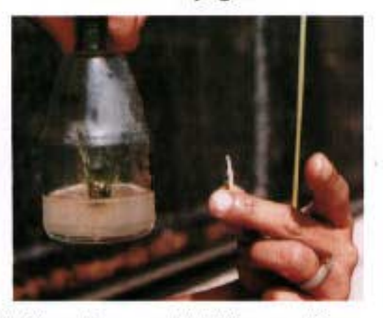
Explant (young inflorescence) held in fingers and tissuecultured planlets grown in the bottle

Fully-grown plantlets in bottles ready to be taken out