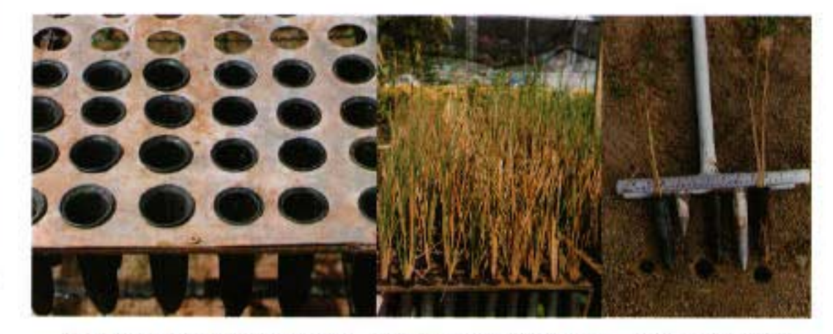
Aluminum tray to hold 80 dibbling tubes