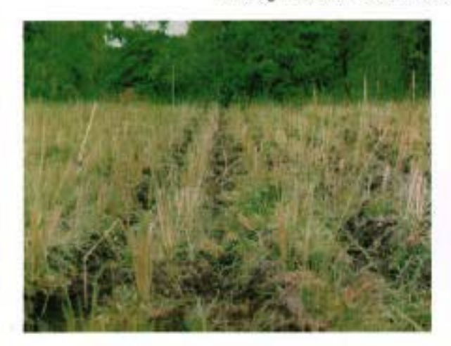
Planting bare-root tillers in paddy field