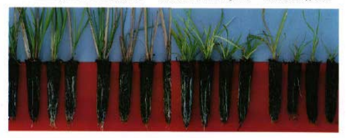
Vetiver grown for 8 weeks in dibbling tubes; removed from dibbling tubes to show medium held by root mass Above - with medium, Below - medium removed; Left - bare-root tillers, Right - tissue-cultured plantiets