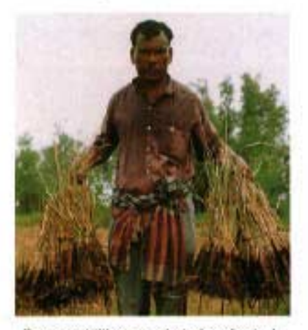
Bare-root tillers ready to be planted directly in the field

Acclimatization of vetiver tillers planted in small polybags before transplanting in the field