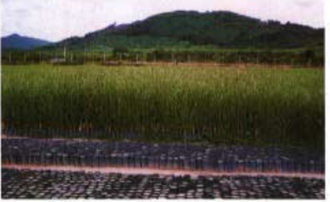
Polybags filled with planting medium (foreground) and those planted with vetiver tillers ready to be transplanted