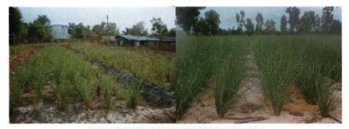
Planting bare-root tillers on raised beds for multiplication