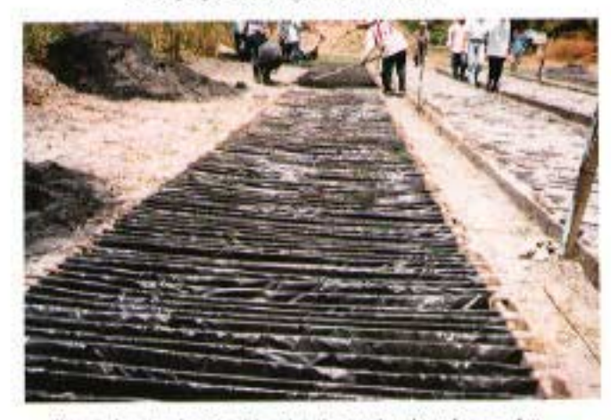
Preparing beds for strip planting using bamboo poles placed 10 cm apart and lined with plastic sheet