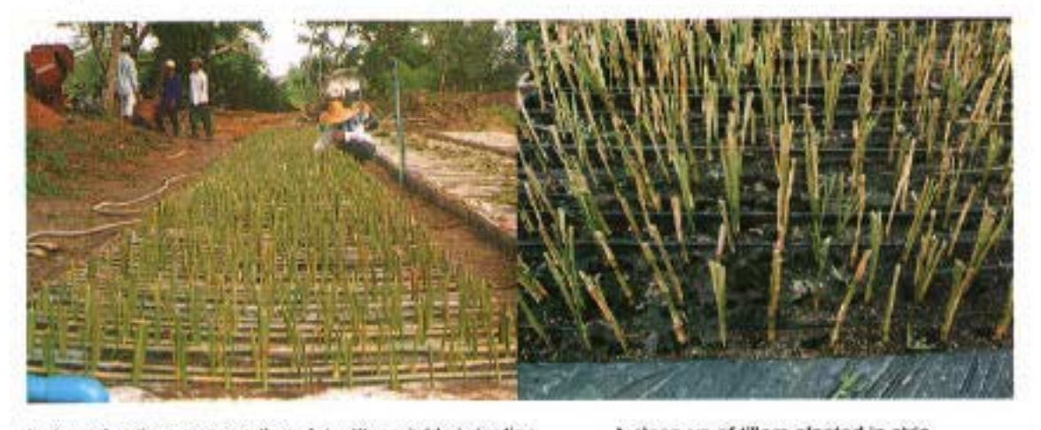
A view of vetiver propagating plot with sprinkle irrigation