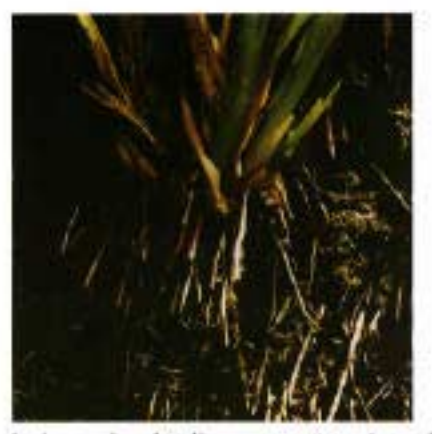
A clump showing its numerous roots and tillers developed from the base of the stem