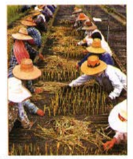
Planting bare-root tillers in prepared beds