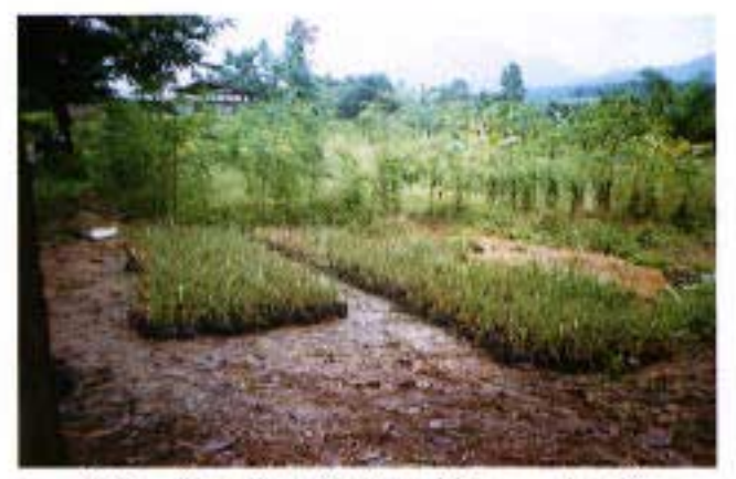
Vetiver tillers planted in the polybags ready to be transplanted in the field

Acclimatization of vetiver tillers planted in small polybags before transplanting in the field