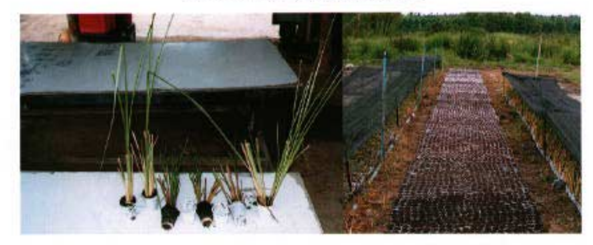
Soft drink cups can be used as containers for vetiver propagation (as used by a school project)