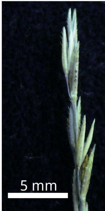
Fig. 2. Photograph of the vetiver spikelets sampled in Mizugaura, Uwajima City.

reproductive traits to those of the variety identified at the sites of the present study.