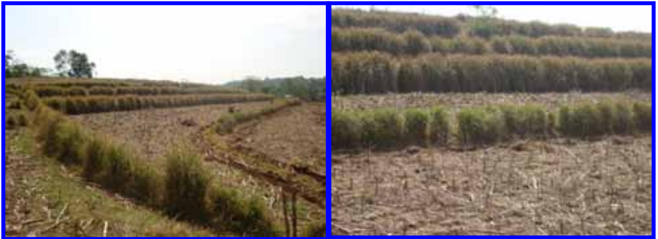
Farm land protected with vetiver terrace Metu- Ethiopia