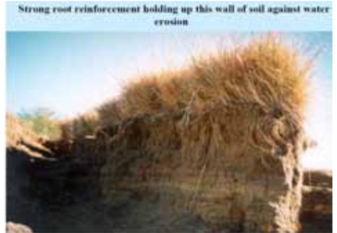
On -Farm Flood Protection