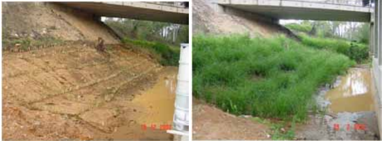
Bridge abutment stabilization