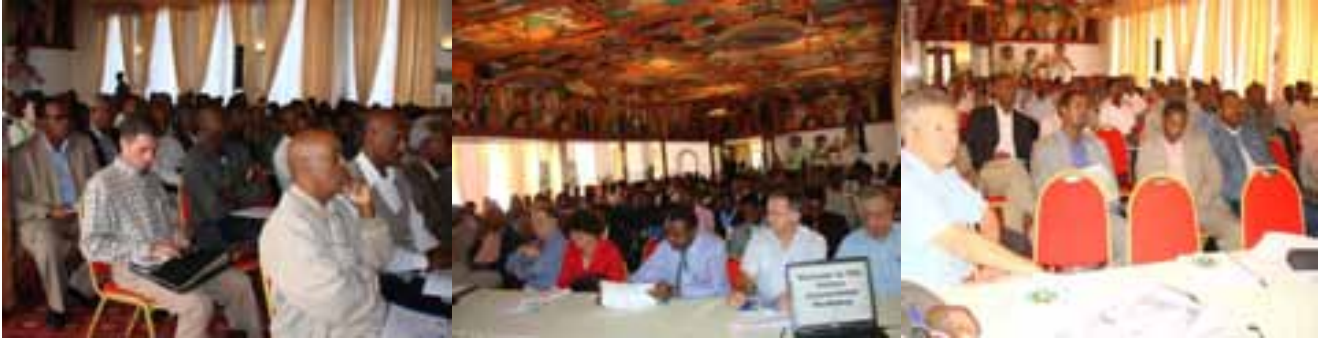
Partial overview of the workshop participants

food security in Ethiopia have participated. Nine of the resource persons were from abroad representing TVNI while eight were Ethiopians.