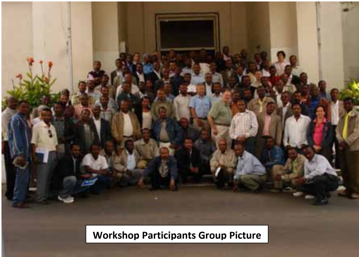
Workshop Participants Group Picture