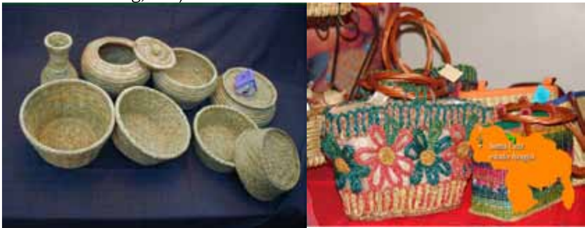
Handy Craft using Vetiver Grass