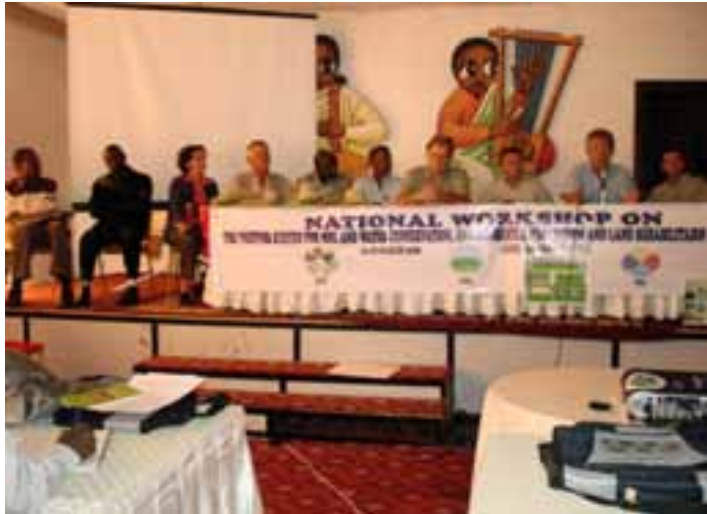
Panel Discussion on progress

The workshop provided a good platform for sharing worldwide experiences, awareness creation, networking and scaling up of the use of VS in Ethiopia. At the end of the workshop a network was established by volunteer members representing the above mentioned organizations to advance the promotion of the Vetiver System in Ethiopia.