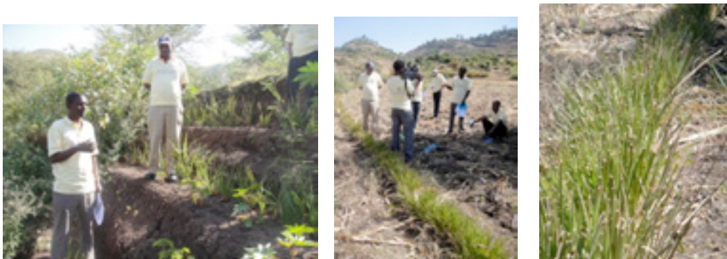
Photo 7: Vetiver application in gully treatment and soil and water conservation (Amhara region)