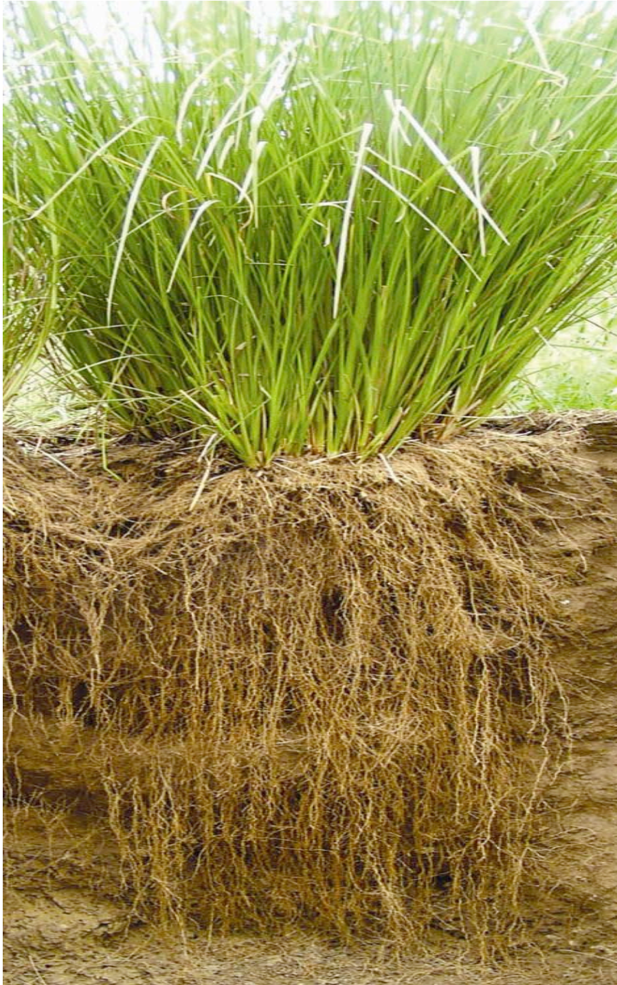
Photo 1: Erect and stiff stems form a dense hedge when planted close together. The roots could penetrate though the hard pan soil.

tool for other, non-agricultural applications such as land stabilization/reclamation, soil erosion and sediment control.