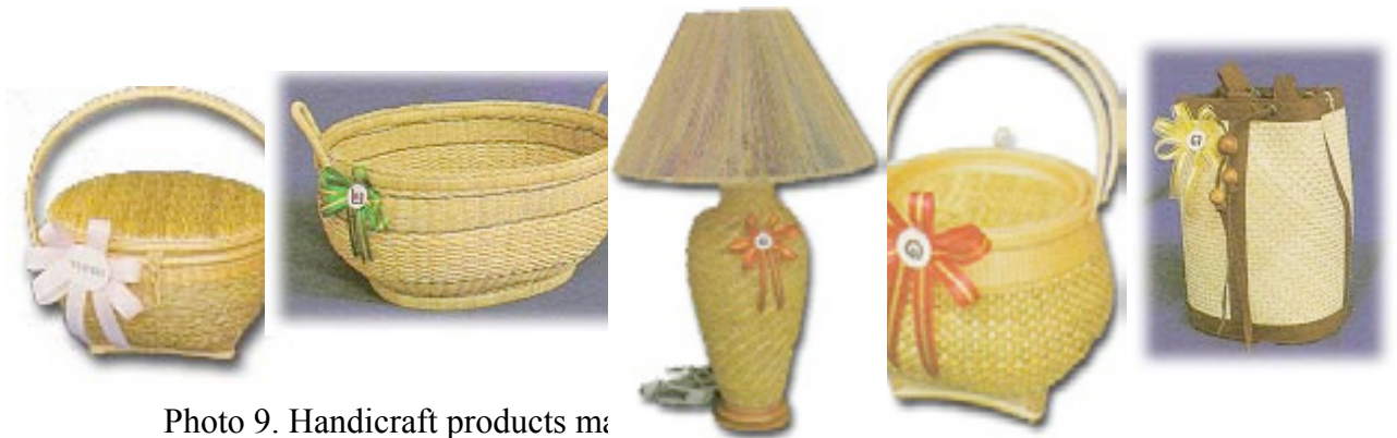
Photo 9. Handicraft products made from Vetiver grass