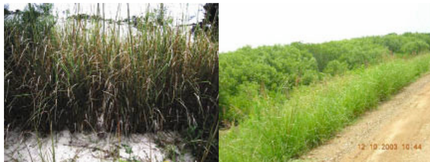
Photo 3: Vetiver on coastal sand dunes in Quang Bình (left), and saline soil in Gò Công Province (right) (Vietnam).