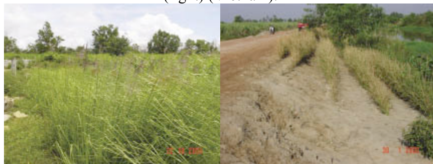
Photo 4: Vetiver on extreme acid sulfate soil in Tân An (left), and alkaline and sodic soil in Ninh Thuận (right) (Vietnam).