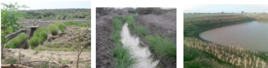
Photo 6: Vetiver grass used for infrastructure protection (Afar region)

A study under coffee-based cropping system showed that Vetiver hedgerow is effective in reducing the soil loss during the third cropping season. It was also noted that the use of Vetiver grass together with physical measures is very important to control the gully side and heads from further erosion (SLUF, 2009). SLUF and its partners have demonstrated and applied the Vetiver system on a large scale in Ethiopia and recommended it as best practice for soil and water conservation and infrastructure protection (Photo 6 and 7). It has also documented that Vetiver grass is a very simple, practical, inexpensive, low maintenance and very effective means of soil and water conservation, sediment control, land stabilizations and rehabilitation, and phyto-remediation (SLUF, 2010). Currently the grass has become widely known throughout the country with numerous successful applications for road cut-slope stability enhancement, erosion/flood control of embankments, dykes, riverbanks, sand dune fixation as well as waste and leachate control etc.