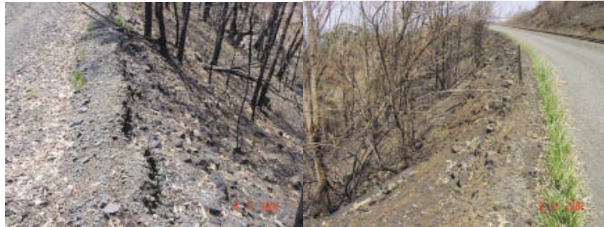
Photo 2: left: Vetiver grass surviving forest fire; right: two months after the fire (Australia).