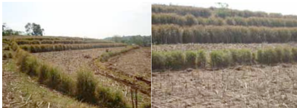
Photo 5. Farm land protected with Vetiver terrace Metu- Ethiopia