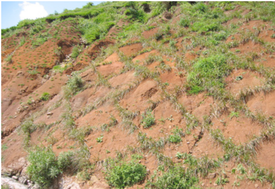
Photo 5. Applications of Vetiver grass for landscape stabilization (GTZ-IFSP/ South Gonder, 2005)

The grass has been used intensively for soil and water conservation and stabilization of steep slopes (Photo 5). The effects of Vetiver hedges in controlling flood water and soil erosion were studied at Jima Research Center (Tesfu Kebede and Tesfaye Yakob, 2009). The findings were successful in reducing flood velocity and limiting soil movement, resulting in very little erosion in the third year.