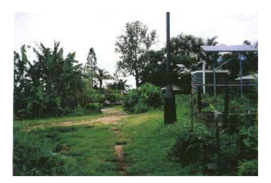
Photograph A: Rear of worm composting toilet, its solar panel, evapotranspiration bed on left

Originally the evapotranspiration area was planted solely with native plants and banana trees. There were some soggy areas so Keith Burnett contacted Dr Paul Truong of Qld Department of Natural Resources concerning use of Monto Vetiver grass.