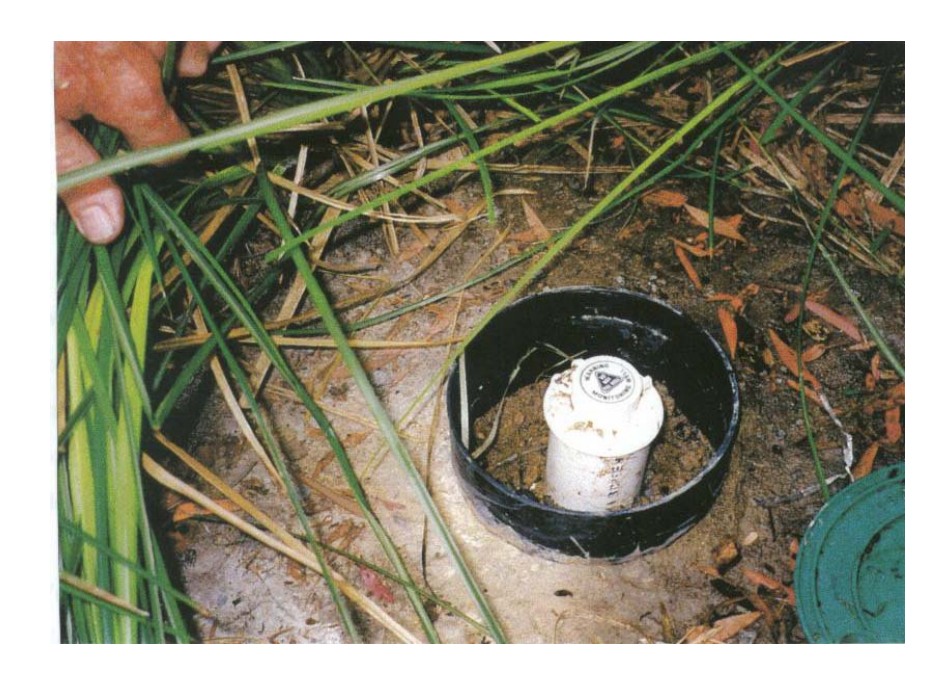
Photograph D: Well BW2, above ground casing, downgradient from well BW1