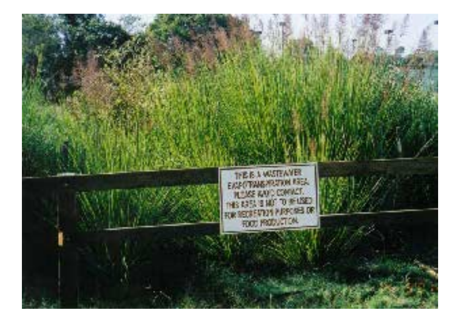
Photograph B: Front of evapotranspiration area, Vetiver grass in background

These groundwater quality tests at Beelarong Community Farm are a contribution to Vetiver grass research. Dr Paul Truong is currently conducting further research into wastewater treatment with Vetiver at other sites, a number in conjunction with Codyhart Consulting. The results to hand are pleasing and corroborate those found in these Beelarong results.